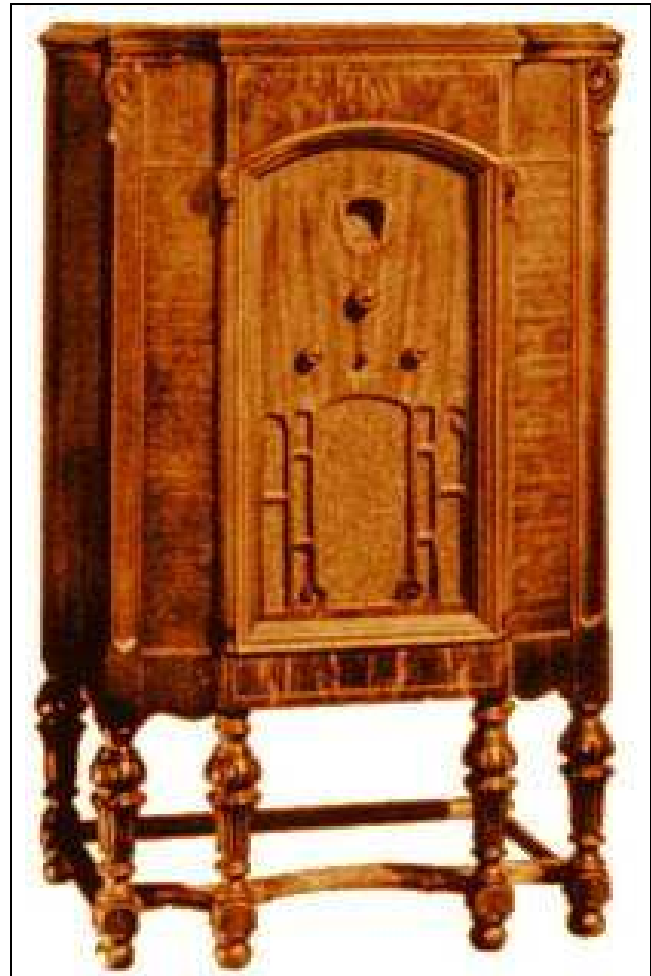
An Early Philco Radio Phonograph