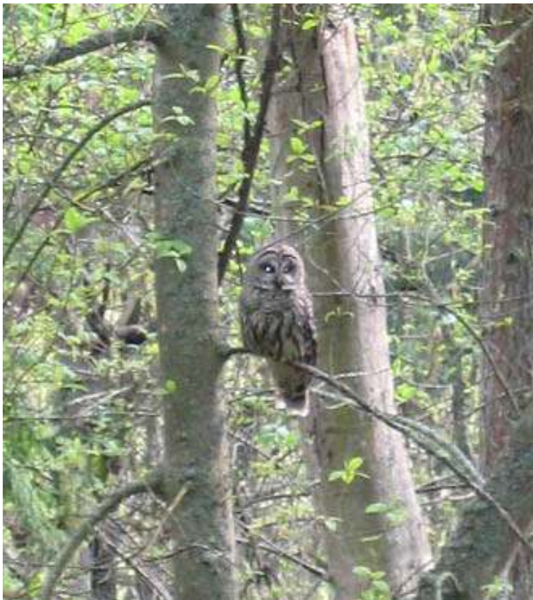
Barred owl, Discovery Park, Seattle, April 2007)

* Photography : It's now almost exclusively digital and, apart from my professional work, mostly of outdoor scenes and wildlife. The camera goes along on all my hiking trips. And that brings me to the next item: